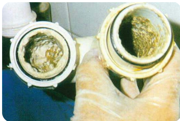
without Bio Blocks

Bio Blocks (not money) down your drains this year.