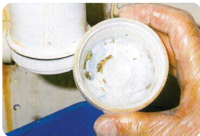
with Bio Blocks

Bio Blocks do not contain pDCB or other dangerous chemicals and are particularly suitable for use in public buildings, schools, institutions, hotels, pubs, clubs and restaurants. The pictures above show two urinal outlets after six months use - one using Bio Blocks, the other no blocks at all.